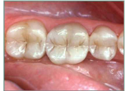
A natural look

Resin fillings are a great way to restore your back teeth. Because they bond directly to teeth, they provide the added strength that damaged teeth need to withstand frequent biting pressure. Also, we can match the color of the resin to your teeth to preserve your beautiful, natural-looking smile.